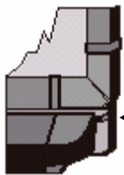
Ready Light on right side of pen tray

The Ready Light indicates the status of your interactive whiteboard. Depending on the model of the SMART Board interactive whiteboard you are using, the Ready Light is located either on the right side of the pen tray or the lower-right of the frame bezel.