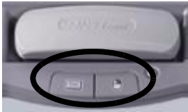
Pen tray buttons

The pen tray has at least two pen-tray buttons. One button is used to launch the On-Screen Keyboard. The second button is used to make your next touch on the interactive whiteboard a right-click. Some interactive whiteboards have a third button; this button is used to quickly access the Help Center.